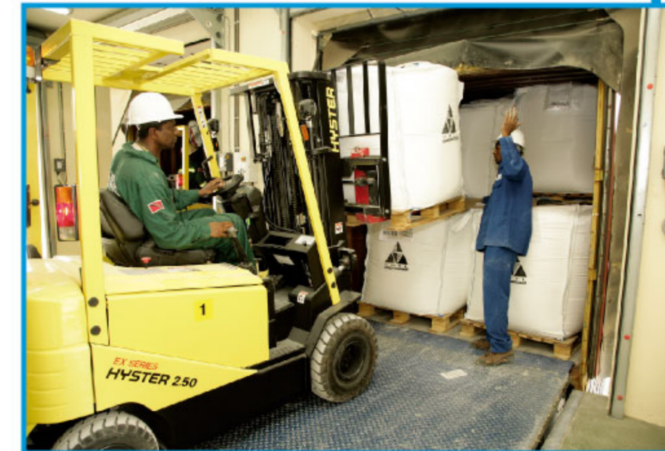
KS Chinpire forklift operator loading a container under the guidance and supervision of IPSL staff