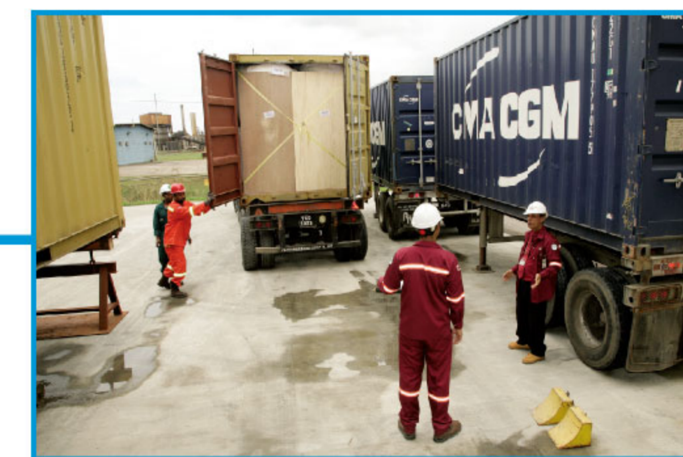
Premier Customs Brokerage staff witness the closing of a container for delivery to the Port for shipping