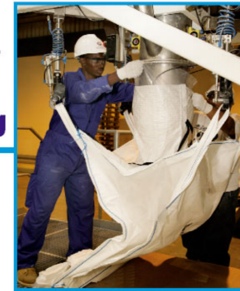
Super Industrial Services (SIS) Operator at the bag filling station