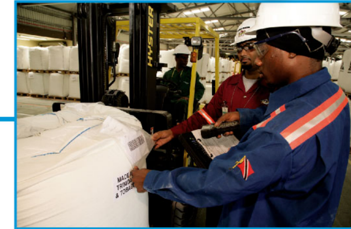
IPSL staff scanning product out of inventory, while Premier Customs Brokerage staff witness the operation